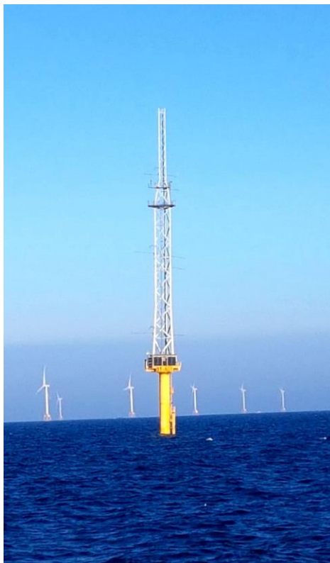
Figure 1 – Photograph of the Meteorological Mast

Updates on when the repair works will take place and the vessel(s) involved in the work will be provided through future NtMs.